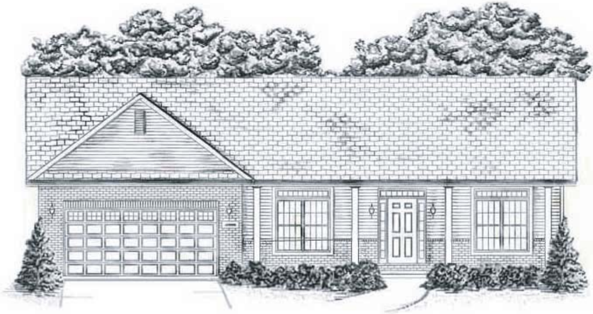
OPTIONAL ELEVATION A