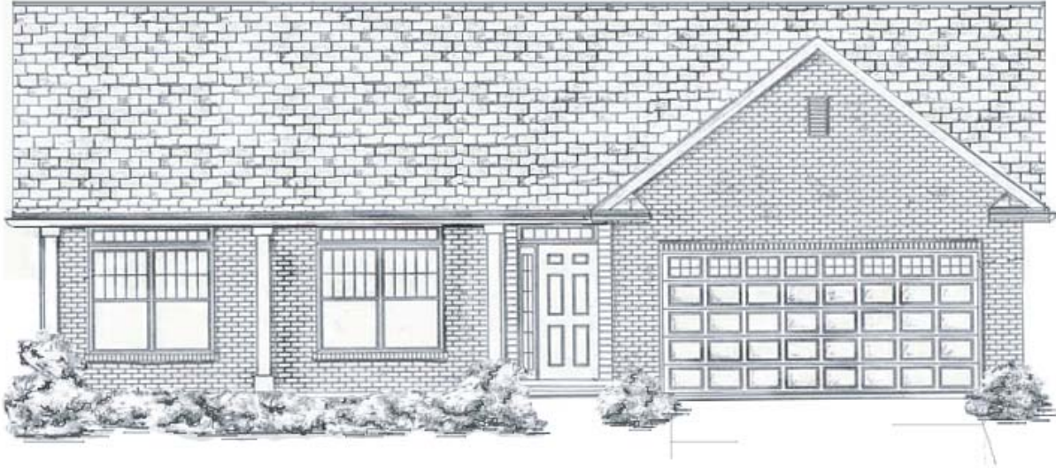
OPTIONAL ELEVATION A